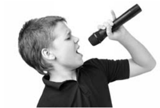
5. The boy _____