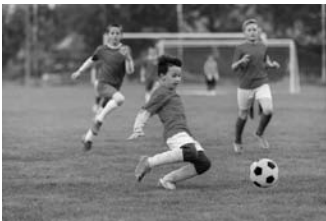
2. They _____