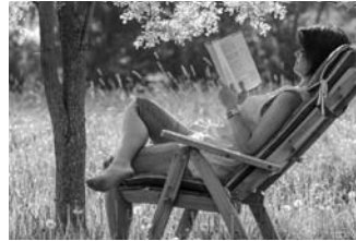
3. She _____