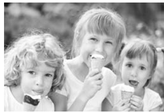
4. The girls _____