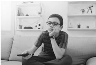
1. He _____