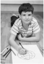
He is drawing a picture.